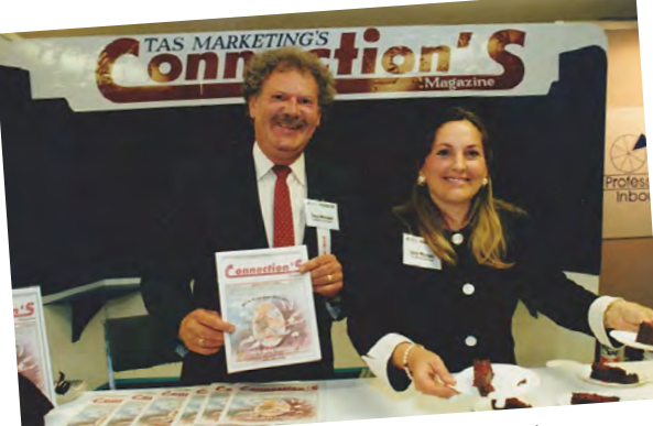
Founders of the Connections Magazine handing out treats at a trade show.