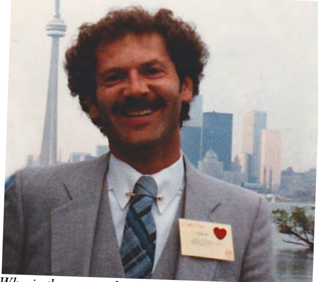
Who is the guy with all the hair?