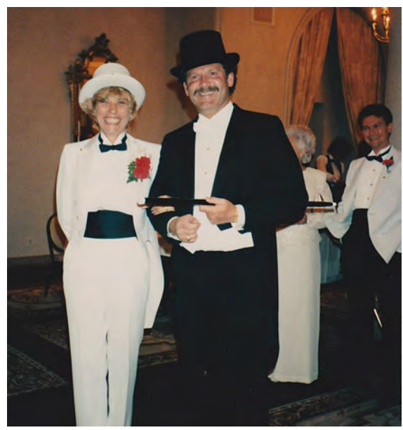
King & Queen of the Ball